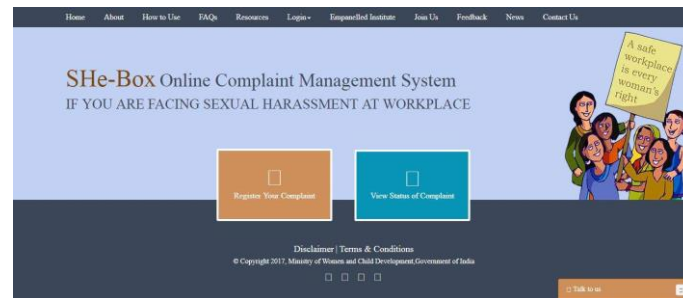
2 Fig.2: Portal of SHe-BOX

employer. Through this portal, WCD as well as complainant can monitor the progress of inquiry conducted by the ICC/LCC[4].