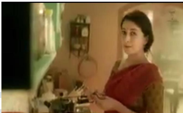
1. Mr. Gold –Women and kitchen

Break the Stereotypes: Stereotyping of women in media need to be stopped. Stereotyping of women definitely leads to inequality. Following are the few advertisements which still follow up the stereotypes.