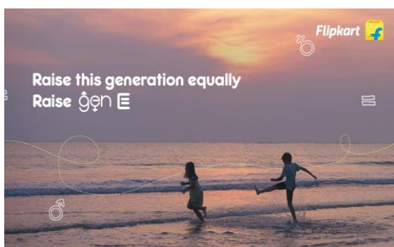
3. Flipkart(2018) – We are here to live equal generation