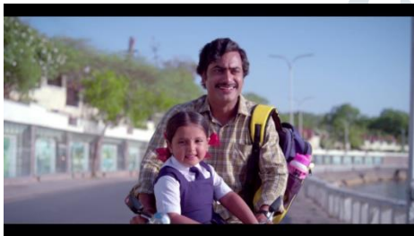
3. Mahindra Rise – “LadkiHaath se NikalJayegi”