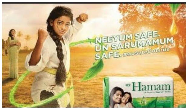
1. Hamam Soap (2018) – Promoting self defense