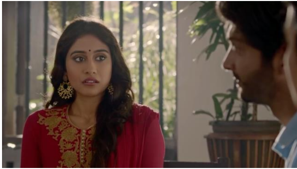
1. BIBA Shop Online – “Change is beautiful”