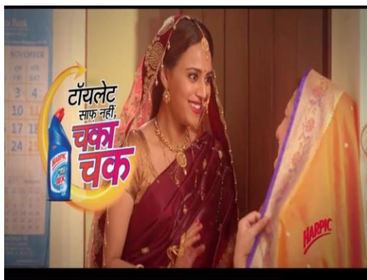
Harpic Swacch Bharat 30sec