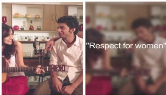
2. Havells Fan – “Respect for Women”