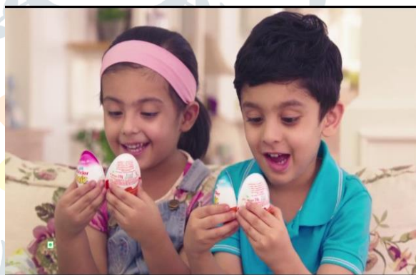
2. Kinder Joy – Highly stereotyping

MR GOLD SUNFLOWER OIL | 2018 | MADBOYS CREATIVE