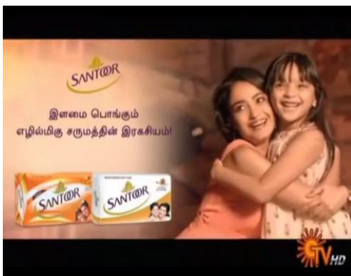
Santoor Soap Ad

Thus the time has come to stop all kinds of stereotyping of women or abusing women and also stop the wrong portrayal of women in media. Thus contributing to the social change and the transitions which could provide women the right place of what she is worthy enough and hence reflecting towards social equity.