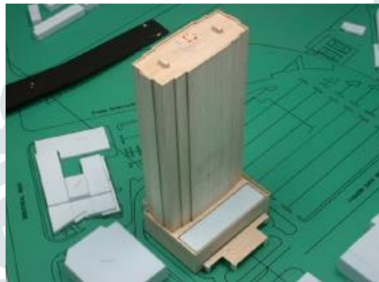
Rectangular shape building

Regular building shapes were chosen for incorporation in this examination. Figure 1 introduces a photograph of a seed working for each the shapes contemplated. Test seeds were tried to have open surroundings to maintain a strategic distance from remarkable task explicit breeze impacts caused by neighboring structures. From the database, four structures for every one of the five essential building impressions considered were recognized. The investigation additionally considered seeds for different Reynold's numbers ( Re ), which ought to be recognized while thinking about the outcomes. The variety of Re for the different examinations was constrained to \pm 150,000 .