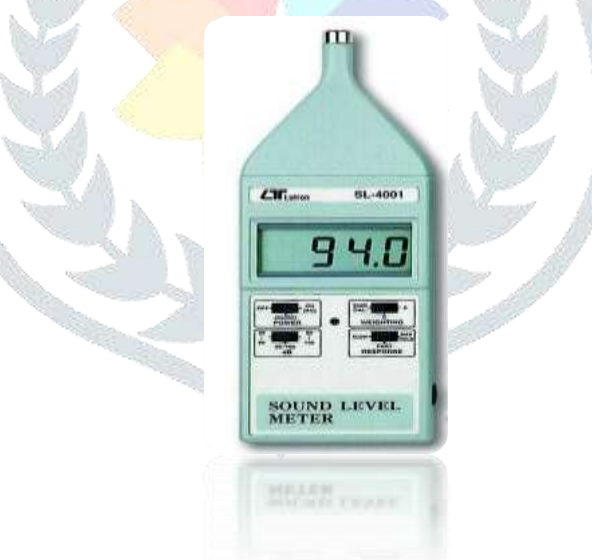
Figure 4. Sound level meter [Lutron SL- 4001]