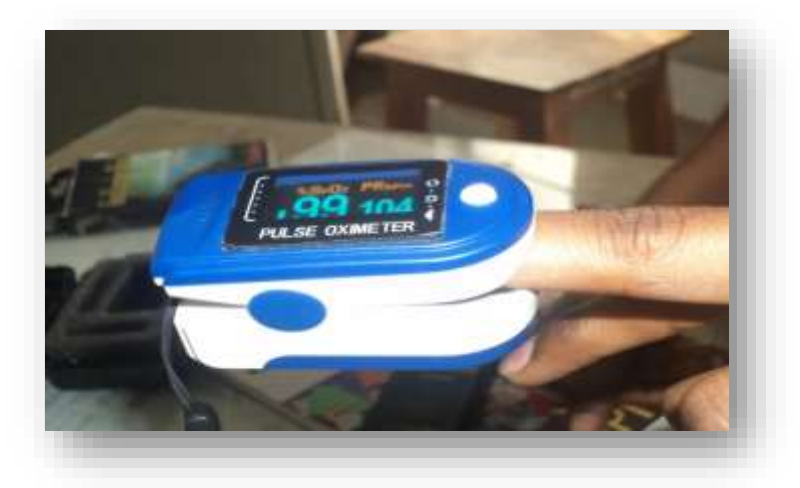
Figure 3. Pulse oximeter [FP050]