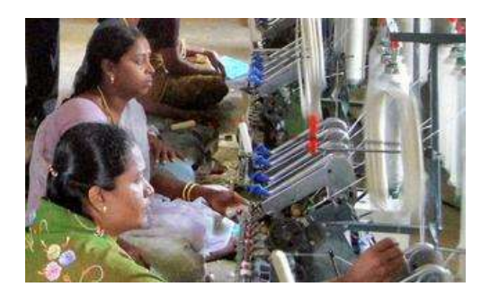
Figure 2. Women Worker Working On Ambar Charkha

In this we take the woman operator operating on Ambar Charkha under consideration no known logic can be applied correlating the various dependent and independent parameters. As there is large difference in work output obtained from a Male worker and female worker, again work output is changes as per different categories of female worker according to their age. The experimentation of Ambar Charkha involves the following steps.[6]