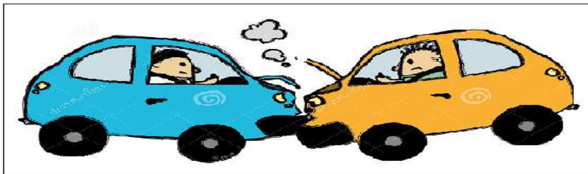
Fig Proposed Model

The accident avoidance system helps to avoid the regular accidents that will normally occurring on highways and in city traffic. These accidents are mainly happened by distraction, unconsciousness, and distance unknown between our vehicles. So let us consider the Indian roads and we will have 2 ultrasonic sensors where one is placed in the front and another one behind the car. Due to this sensor, we can calculate the distance of other automobiles nearing us. Thus we can locate other cars and we can protect ourselves from accidents. The diagrammatic representation of the scenario is explained as