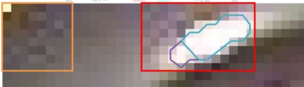
Figure5–JPEG file type generic image detail after edited only3 (three) pixels and saved20 (twenty) times. It is clear that the areas around the edited pixels have changed because of file compression calculation. Therefore, the original image data has changed, which can result negatively in the application of PADI.