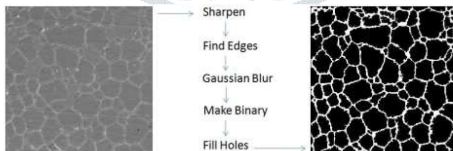
Figure1-Process binarization image of a micro structure of zirconia-based ceramics doped compound of yttrium and rare earths.

An example of this problem can lighten their understanding. Based on the study presented in [1], theoretically, following step by step all the necessary requirements to replicate the image processing to correct grain counting, the resulting image displayed in the study can be seen in Figure 1.