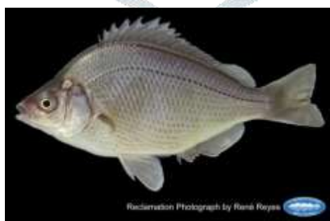
Figure3–Generic image of a fish (because the lack of images related to the area of materials science with public links to the original images).

IV. Figure3 shows a generic image of a fish. The original image is a file type TIFF with is solution of 300 dpi, 24-bit color and total size of 7.17 MB. This file is too large to compose a document like this article, then, this TIFF file is converted to a file type JPEG with the same resolution of 300 dpi, same 24-bit color, and the file size resulting in almost a thousand times smaller than the original, only 856KB. The drastic reduction of the size of file confirms that many original image information were discarded and lost. Such information has great chance to be critical for automated PADI, despite the impression that gets nothing changed.