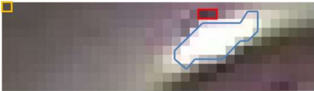
Figure4–JPEG file type original generic image detail. Here are the 3(three) highlighted pixels to be edited: one in the left upper corner, two in the right upper side of image where shows a space (which could be a grain oracell) limited by a range of pixels value.

By the way, there is still one more aggravating when it comes specifically to the JPEG file type (the file type most used nowadays). Each time the file is saved, the calculation of image compression is performed again. If you have edited any pixel in the image, the calculation of its compression will significantly alter the pixels around it (see Figures 4, 5 and 6). If these pixels were originally a cell, a grain or a precipitate, which will have its size measured in an automated way, the sizes resulting would be different, which could compromise a study requiring accurate and lower margins of possible error, as in the areas of precision mechanics and nuclear.