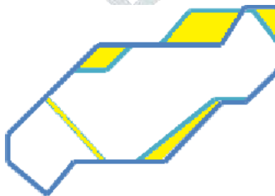
Figure6–Overlapping areas observed in figures2 and 3.In the filled areas are presented the differences between them.