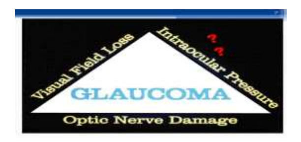
Fig.1. Glaucoma tree