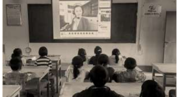
Plate: Could online classrooms be the answer to deduct the cost of education or replace of classroom teacher?<sup>3</sup>

Being a teacher my area of concern on teacher, teaching and the future of our society. In every sector of education we are applying web or internet as the gift of technology. It's very good but the problem is another place. Indian as well as the whole countries are moving towards the adapting technology in place of teachers even. Distance education had stated since 1985 in India and now MOOC (Massive Open Online Course) has stated on 2018. Initiatives are good but the future of the teacher, teaching and the students are not secured. Internet based online education has replaced in the dais of a teacher. And the days are coming when the teachers have no need to go in class even students have same. The first proof is MOOC which was started since 2008 in USA and only within the 10 years it has adopted by UGC in India. 'UGC (Credit Framework for Online Learning Courses through SWAYAM) Regulation, 2016 in the Gazette of India on 19th July, 2016 wherein credit transfer for online courses under SWAYAM platform of Government of India has been defined.<sup>2</sup> The application of such type of courses are praised able. But not the optional in place of teacher.