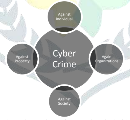
Figure-2: Classification of cyber crime

The table Table-3, Table-4, Table-5 and Table-6 describes cyber crime against individuals, against property, against the organization and against society.