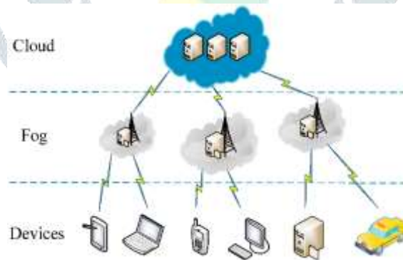
Figure 2: Cloud-Fog-IoT hierarchy

Figure 1 describes the basic structure and entities of a fog computing environment. IoT is comprised of all smart devices that are interconnected by a backbone network and the internet. The fog nodes are deployed at the edge of the network. Fog nodes are typically devices with storage and minimal computational capability. They are equipped to respond to highly latency sensitive events at the edge of the network. They also deploy applications for the discovery, management and inter-communication of IoT devices. One or more fog servers can also be deployed nearer to the edge of the network that act like cloudlets or mini cloud servers, that provide applications and analytics of data from the IoT devices.