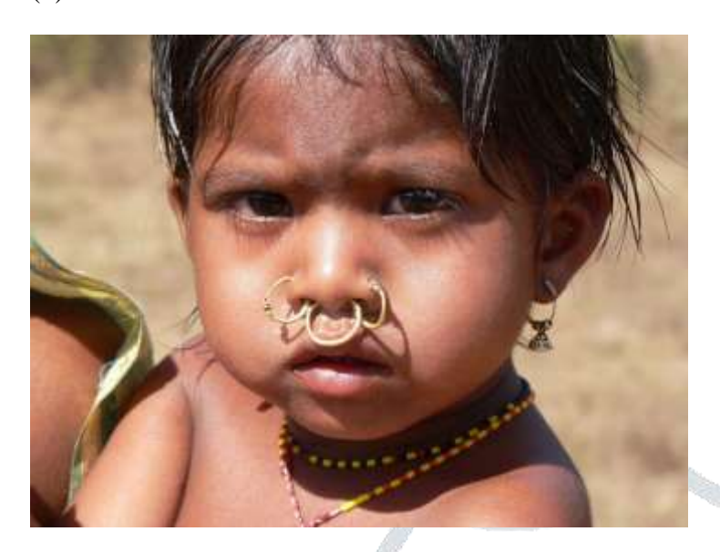
A baby girl of Dongia Kondh use Mungeli Murma (Nose Ring) which is made out of gold.