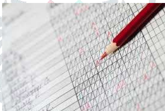
fig: manual student attendance system

Due to student's interest in classrooms, and whose is the largest union in the study environment of university or institution, so recording absence at a department having a large number of students in a classroom is a difficult task and time-consuming. Moreover, the process takes much time, and many efforts are spent by the staff of the department to complete the attendance rates for each student. So in many institutions and academic organizations, attendance is a very important criterion which is used for various purposes. These purposes include record keeping, assessment of students, and promotion of optimal and consistent attendance in class. As long as in many developing countries, a minimum percentage of class attendance is required in most institutions and this policy has not been adhered to, because of the various challenges the present method of taking attendance presents. The process of recording attendances for students was in the form of hardcopy papers and the system was manually done. Besides wasting time and taking efforts for preparing sheets and documents, other disadvantages may be visible to the traditional one due to loss or damage to the sheets-sheet could be stolen.