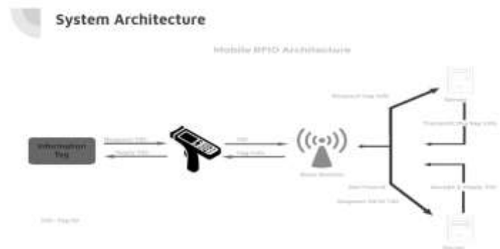
Fig. System Architecture