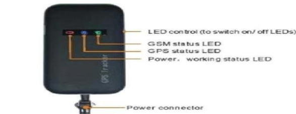
Fig. 2 Module- External view

Bus Owner management, phonebook management, GSM signal quality measuring, incoming calls forwarding and notification. Performances: max 20 SMS/minute.