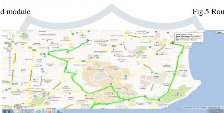
Fig.5 Route Tracked