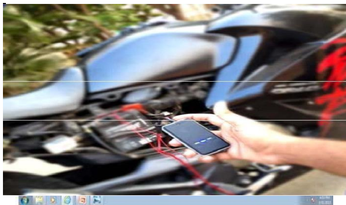
Fig.4 Installed module