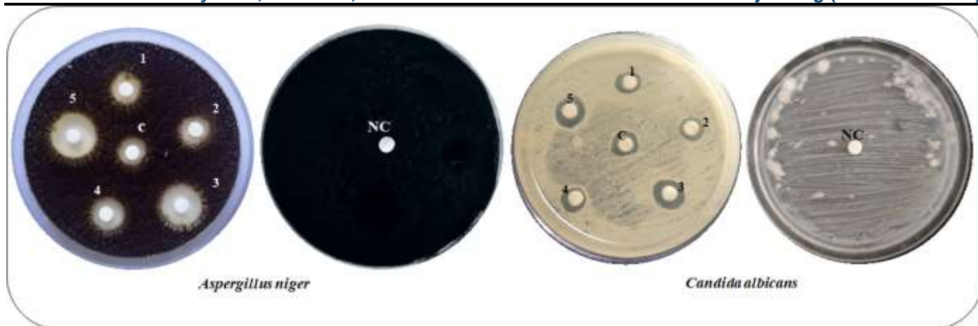
Fig. 3. Antifungal properties of five marine isolates (KPN-1 to KPN-5 and C- Positive control)