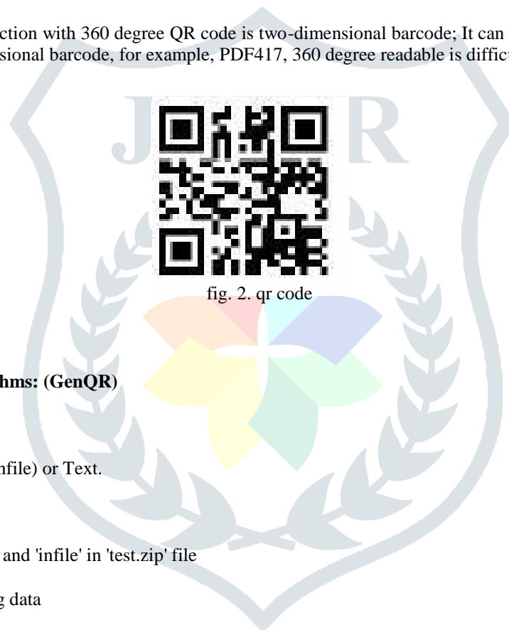
fig. 2. qr code