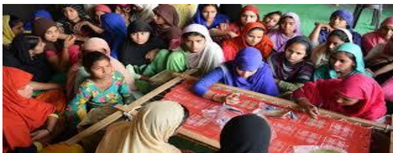
Fig.3 Women's importance in India