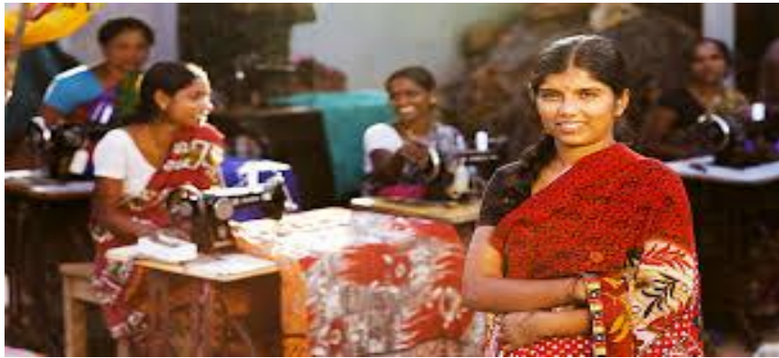
Fig.2 Women Empowerment Education and Work