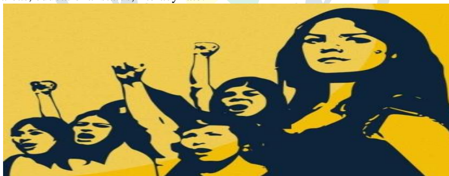
Fig.1 Women Empowerment

Empowerment actually means raising status of a woman or providing them equality through education, working environment and allowing such beautiful beings to make life-determining decisions of their own in our society, that they previously were denied off and how their rightful powers must be given to them at household and occupational levels. Gender equality plays a very major role in women empowerment.[1]Women empowerment is about every women out there in the world. Well said" Each time a woman stands up for herself she stands up for all women", Women empowerment is actually dependent on many variables like caste, age, rural or urban areas, educational status, literacy rate.