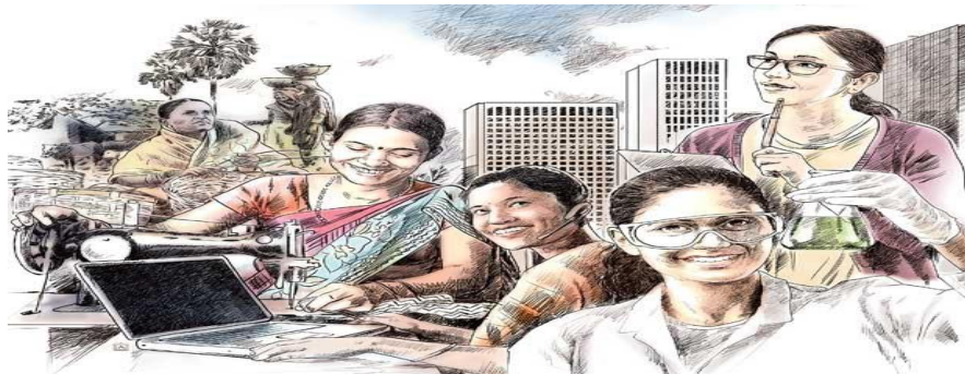
Fig.5 Women Empowerment Improved Performance

and she takes care of everyone related to her and the same women is not given equality or not treated well in society. The empowerment of women has not only become a major topic at National level but also at international level and in every city, state or country actions are being taken. They have started participating in economical, political and social issues and women nowadays have full access and are provided with same facilities as men and are given equal preference in each and every sector and they are working day and night to make world a better place which has improved every country's literacy rate, economy values.