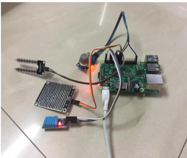
Figure 2 Hardware of the system

We have developed the website of greenhouse monitoring system as shown in figure 10.1. This web browser displays a web page on a monitor or mobile device. On a network, a web browser can retrieve a web page from a remote web server. This web server is used access a private network such as a corporate intranet. The web browser uses the Hypertext Transfer Protocol (HTTP) to make such requests to the web server.