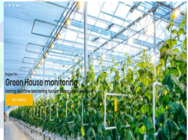
Figure 3 web page input window