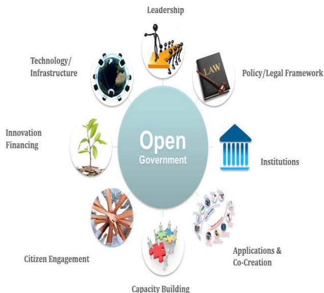
Figure A. Key drivers of savvy administration.

for conceivable arrangement suggestion. Since nobody can deny the significance of innovation for the general population part. As indicated by Lithuania-2030 procedure "brilliant administration is administration framework which is open and participatory, conveying request based, esteem based and superb administrations with competency and professionally which ready to take vital choices.