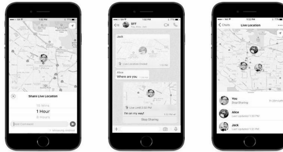
Figure: Live Location Tracking in WhatsApp [1]