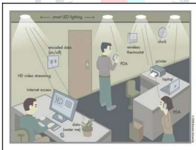
Fig. 3. Li-Fi system connecting devices in a room

The data can be encoded in the light by varying the flickering rate at which the LEDs flicker on and off to generate different strings of 1s and 0s. The LED intensity is modulated so rapidly that human eye cannot notice, so the light of the LED appears constant to humans [6]. Light-emitting diodes (commonly referred to as LEDs and found in traffic and street lights, car brake lights, remote control units and countless other applications) can be switched on and off faster than the human eye can detect, causing the light source to appear to be on continuously, even though it is in fact 'flickering'. The on-off activity of the bulb which seems to be invisible enables data transmission using binary codes: switching on an LED is a logical '1', switching it off is a logical '0'. By varying the rate at which the LEDs flicker on and off, information can be encoded in the light to different combinations of 1s and 0s. This method of using rapid pulses of light to transmit information wirelessly is technically referred to as Visible Light Communication (VLC), though it is popularly called as Li-Fi because it can compete with its radio-based rival Wi-Fi. Figure 5 shows a Li-Fi system connecting devices in a room [7].