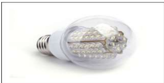
Fig. 1. Li-Fi bulb [8]