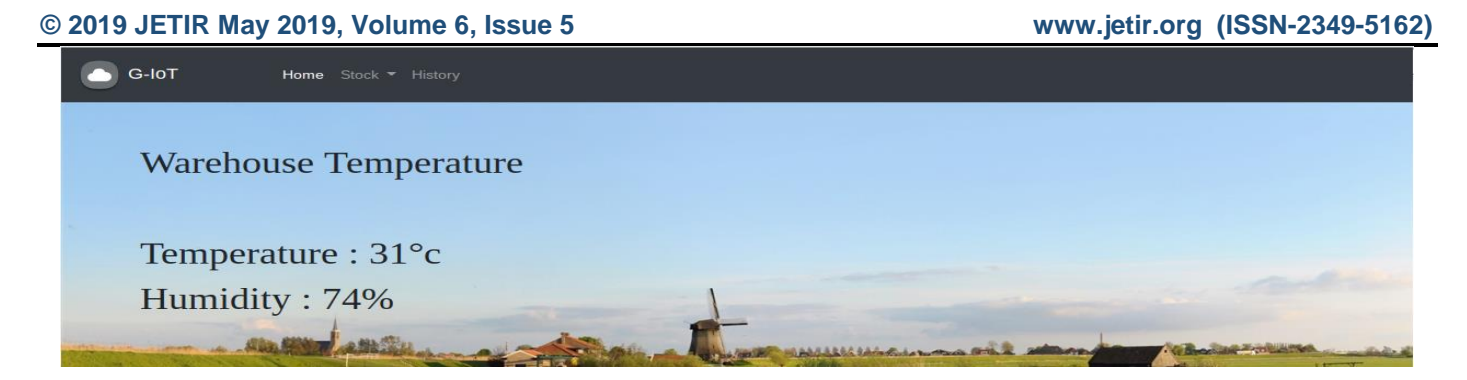
Fig 4.2: Display the actual Temperature and Humidity of Warehouse.

The warehouse database also contains the amount of grain stored within the warehouse the type of grain been stored it also contains the quantity of grain that can be added or removed depending on the warehouse current volume that are currently within the warehouse. This will make the task of the warehouse administrator easy and can perform task hazel-free.