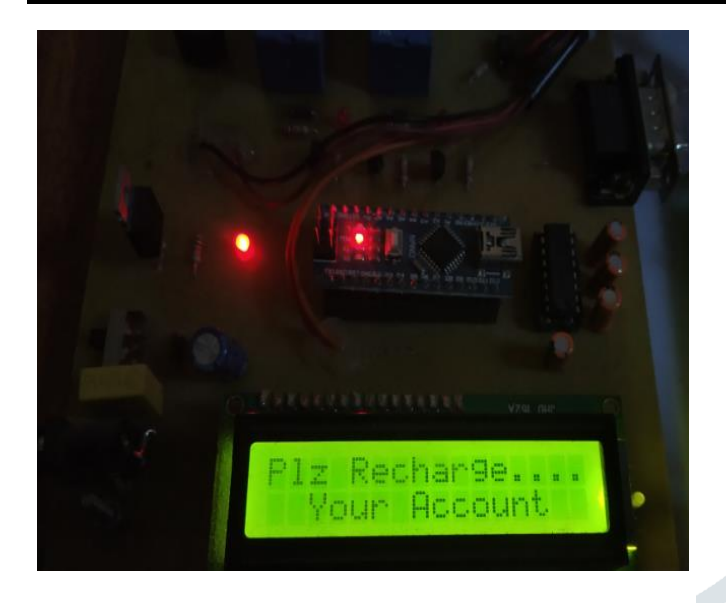
Figure 4 Low balance alert