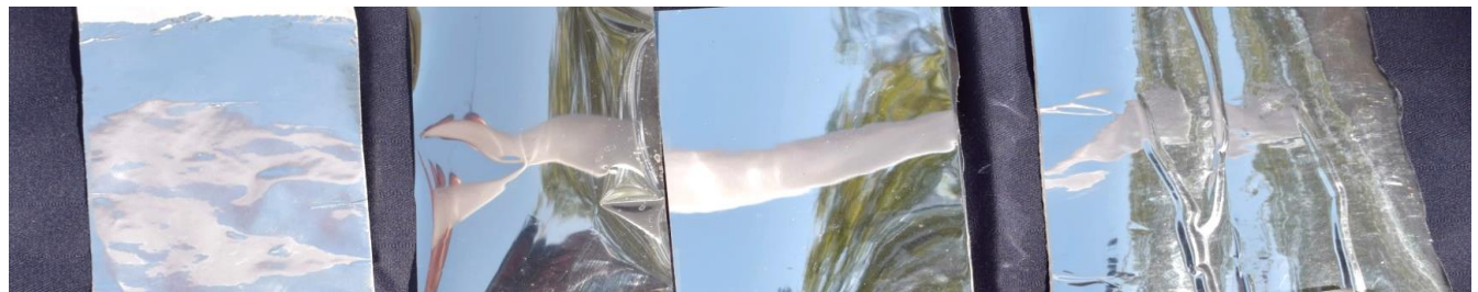
Figure 1: A photo graph of different solar reflective films. From left 1) Aluminium foil tape 2) One-way solar reflective film 3) Mirror wall sticker 4) Vinyl car wrap.

Searching on internet we have come across various types of reflective materials which are made for other purposes, but can be used as reflective material for homemade solar cookers. These include reflective materials such as aluminum foil tape, Mylar, glass mirrors, mirror wall sticker, chrome vinyl, reflective paints and many others. Finding information about these materials on different websites, we find that four out of these many materials more suitable for the use in solar cooker. While choosing these materials we have taken care of the fact that the material is not much costly and is sold by different sellers and websites. Although different sellers name these materials little differently, we have given these materials names by which these can be easily found on the internet using Google search engine. These materials are 1) One-way solar reflective film 2) Vinyl car wrapper 3) Mirror wall sticker and 4) Aluminium foil tape. Following is the information about these materials from different sources.