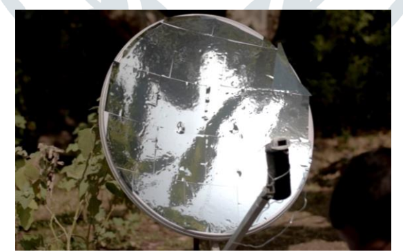
Figure 2 : A photograph of setup.

A test was conducted in which four different types of reflective materials namely One-way-solar-reflective-film, Vinyl-car-wrap, Mirror-wall-sticker, and Aluminium-foil-tape were tested to find best material. In this experiment we constructed solar concentrator using parabolic dish and then different reflective materials were applied on it one by one on different days at approximately same time of the day. The concentrated solar radiation was focused on a black painted aluminum can of 250 ml filled with clean water in each case. The parabolic dish was adjusted manually several times to track the sun movement so that sun rays remain well focused on the can. A digital thermometer was submerged into the water. Initial temperature and consecutive rise in temperature for every one-minute interval was noted. The test for different materials was performed on four different days within 8 days from the start of first experiment. Based on rise of water temperature with time the different reflective materials are compared. The result of the experiment is tabulated below and then plotted on a temperature vs time graph.