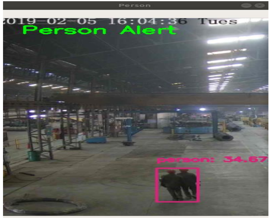
Figure 4. Results on ROI one