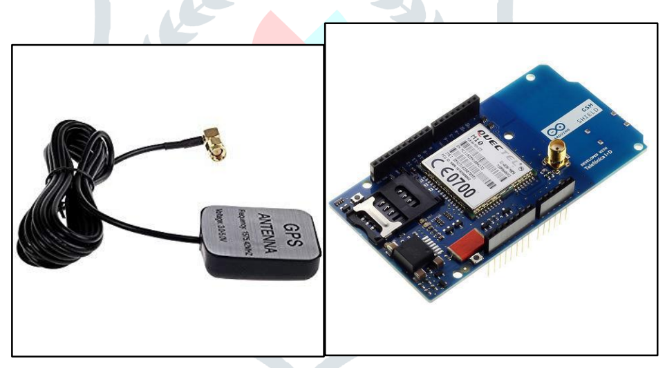
Fig 3: SIM808 GSM GPRS GPS Modem.

A GPS navigation device, GPS receiver, or simply GPS is a device that is capable of receiving information from GPS satellites and then to calculate the device's geographical position. Using suitable software, the device may display the position on a map, and it may offer directions.