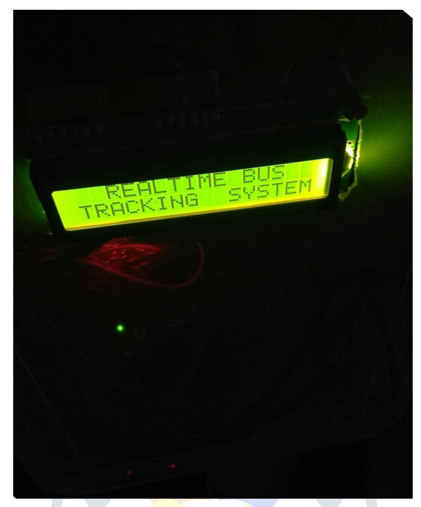
Fig 1: Real Time Bus Status Monitoring

We have proposed a Real-Time Bus Tracking Application which runs on Android smart-phones. The hardware display showcases the name as follows. This enables the user to find out the location of the bus so that they won't get late or won't arrive at the stop too early. The main purpose of this application is to provide an exact location of the user's respective buses in Google Maps when a particular bus is selected besides providing information like bus details, driver details, stops, contact number, routes, etc. This application can be widely used by college students, office worker's, etc since Android smart-phones have become common and affordable for all. It is a real-time system as the current location of the bus is updated every moment in the form of latitude and longitude which is received by the user through their application on Google maps.