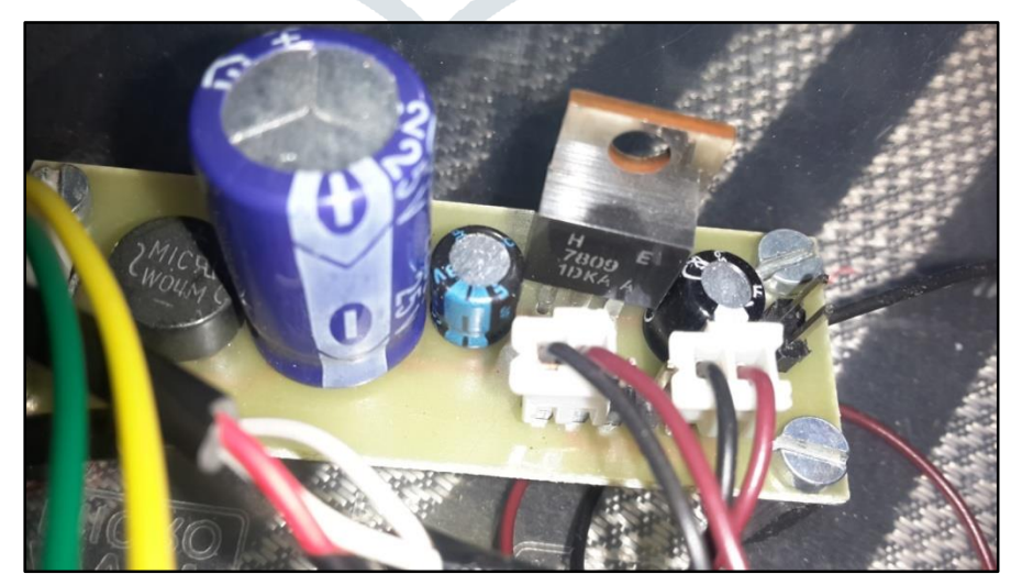
Fig 5: Resistors

In this circuit of resistors, we have components attached to it so that to prevent short circuiting in the whole circuit of our hardware module. In this section of hardware, we have voltage regulators that controls the voltage flow in the circuit.Secondly, we have three different types of capacitors that maintains current integrity during working of the module.