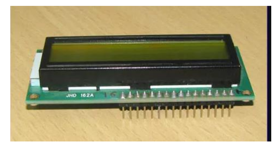
Fig 7: LCD Display