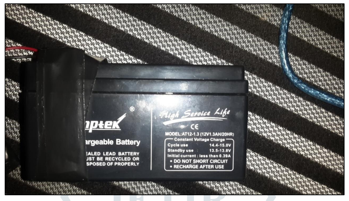
Fig 4: Lead Acid Batteries 14v

Lead-acid batteries designed for starting automotive engines are not designed for deep discharge. They have a large number of thin plates designed for maximum surface area, and therefore maximum current output, which can easily be damaged by deep discharge. Repeated deep discharges will result in capacity loss and ultimately in premature failure, as the electrodes disintegrate due to mechanical stresses that arise from cycling. Starting batteries kept on a continuous float charge will suffer corrosion of the electrodes which will also result in premature failure. Starting batteries should, therefore, be kept open circuit but charged regularly (at least once every two weeks) to prevent sulfation.