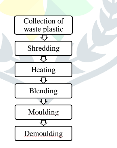
Fig 1 Flow Diagram

The collected waste plastic are cut into a small pieces this process is known as shredding. After shredding, take plastic in a fixed proportion (according to mix calculation) and heated in a pan until it starts melting. While melting add fine aggregate and coarse aggregate in a fixed proportions and stir well until it mix uniformly. It forms a mixture