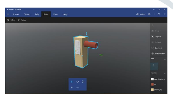
Fig.2: receiver end