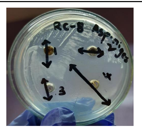
Figure: 6. a).Test compound RC-08 against Aspergillus niger.

Figure: 6.b)Test compound RC-08 against Rhizoctonia solani.