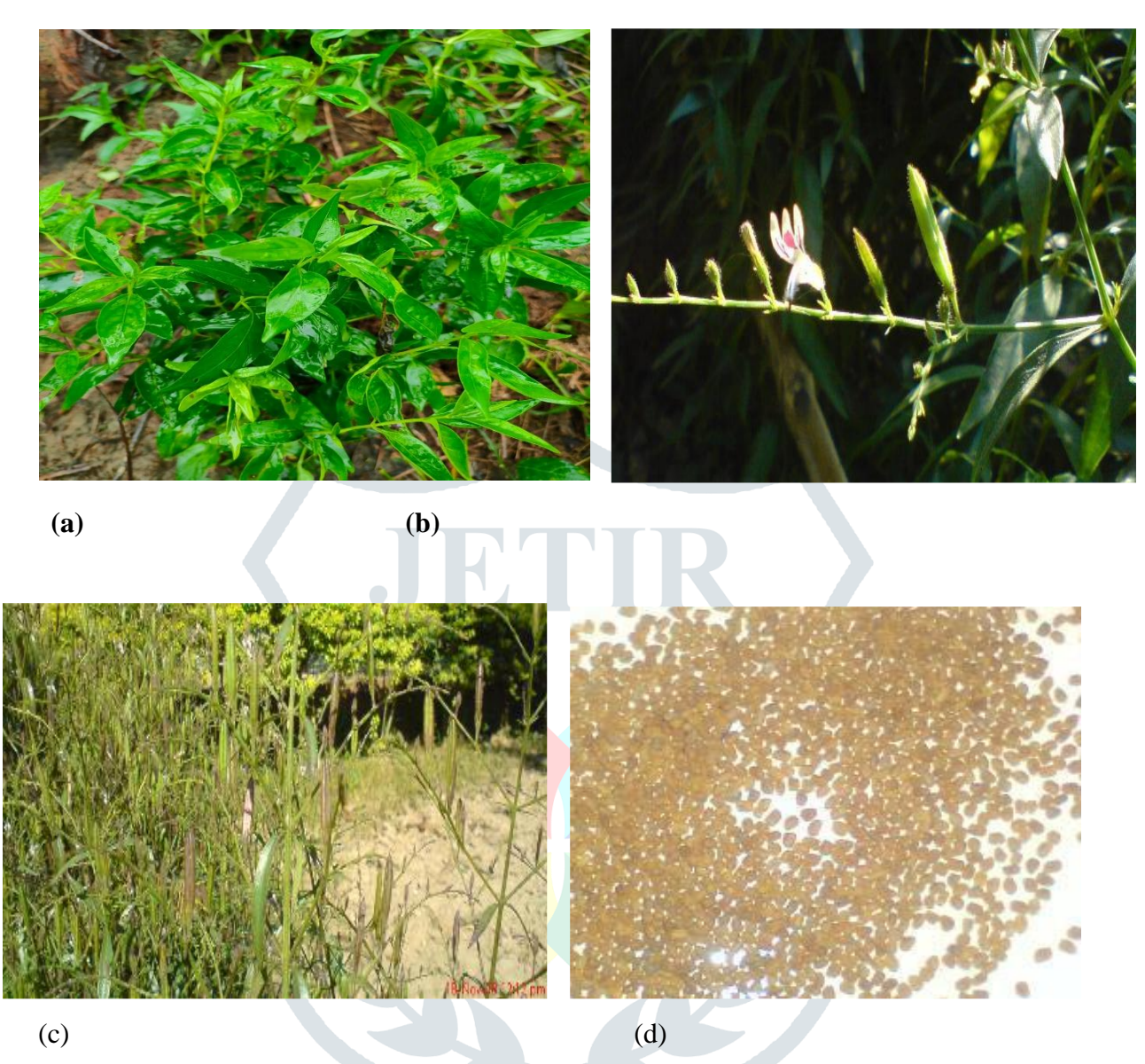
Figure: 3.1. Morphology of Andrographis paniculata showing a) Arial parts with mature and immature capsules; b) flower buds to flowering to capsule formation; c) matured seeds; d) leaves.

1.0-3 cm long and 3–4.5 mm wide. The seeds of Vietnamese medicinal herbs are quite tiny and subquadrate. [24-26].