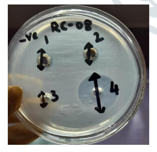
Fig.5 a). Test compound RC-08 againstEscherichia coli.

Table.2: Antibacterial activity showing the diameter of the zones on an organism of bacteria i.e., gram-negative (E.coli) and gram-positive(S.aureus).