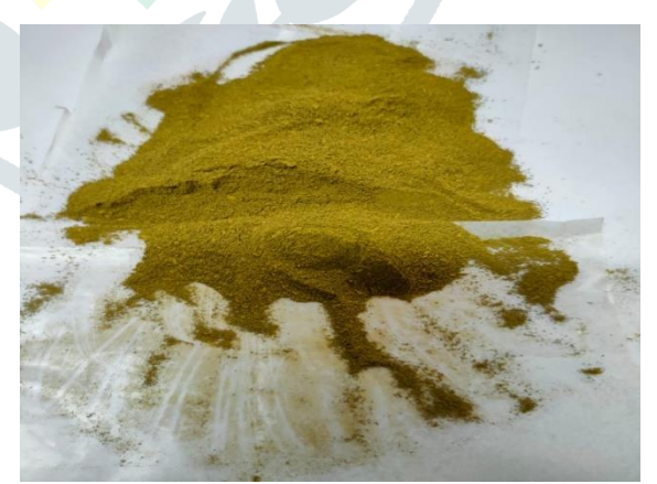
Figure:3.3. Andrographis paniculate leaf powder