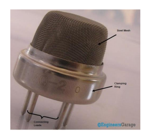
Figure 4: LPG GAS Sensor

gas interacts with this sensor, it is first ionized into its constituents and is then adsorbed by the sensing element. This adsorption creates a potential difference on the element which is conveyed to the processor unit through output pins in form of current.