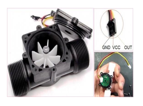
Figure 2: Water Flow Sensor

"Hall Effect Water Flow Sensor" comes with three wires: Red/VCC (5-24V DC Input), Black/GND (0V) and Yellow/OUT (Pulse Output). By counting the pulses from the output of the sensor, we can easily calculate the water flow rate (in litre/hour – L/hr) using a suitable conversion formula.