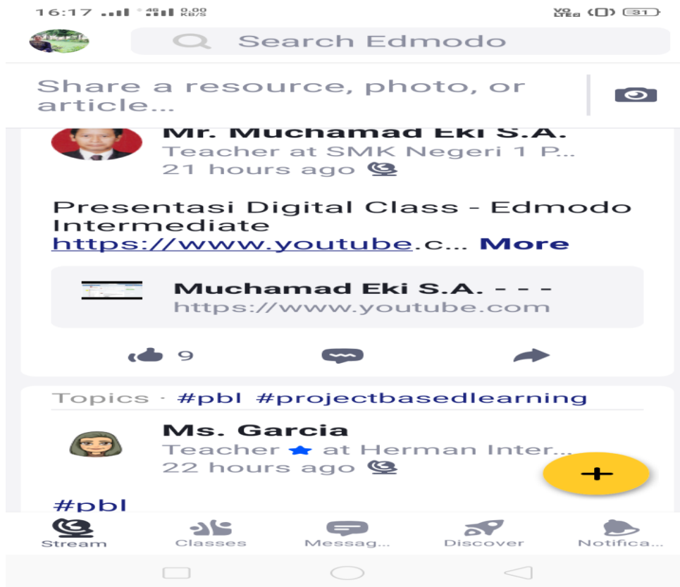
Figure 1: Example of sharing information on EDMODO