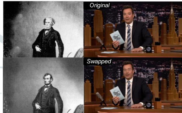
Figure 1. Face swapping isn't new. Models, for example, the swap of U.S. President Lincoln's head with legislator John Calhoun's body were created in mid-nineteenth century (left). Present day devices like FakeApp [2] have made it simple for anybody to create "deepfakes", for example, the one swapping the heads recently night TV has Jimmy Fallon and John Oliver (right).

Ongoing advances [21, 42] have drastically changed the playing field of picture and video control. The democratization of present day devices, for example, Tensorflow [6] or Keras [12] combined with the open openness of the re-penny specialized writing and modest access to figure infras-tructure have moved this change in perspective. Convolutional autoencoders [38, 37] and generative ill-disposed system (GAN) [17, 7] models have made altering pictures and recordings, which used to be held to exceptionally prepared professional fessionals, an extensively open activity inside reach of practically any person with a PC. Cell phone and work area applications like FaceApp [1] and FakeApp [2] are based upon this advancement.