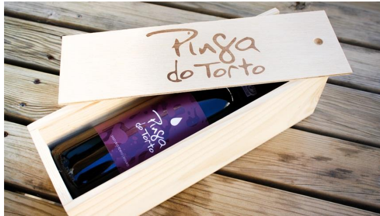
Calligraphy on the box & bottle of limited edition perfume

Because calligraphy is done by hand, it expresses emotion very well. Used in a brand mark or in advertising, good calligraphy can give the user something that technology can't provide: the human touch. But it will always be available in limited edition.