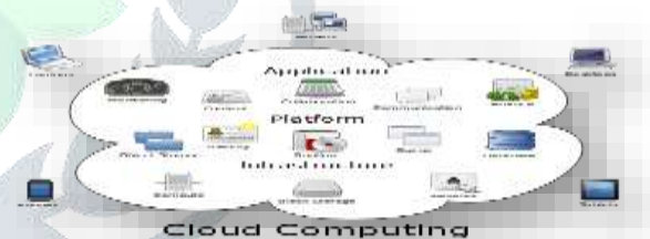
Structure of cloud computing

Cloud computing is the use of computing resources (hardware and software) that are delivered as a service over a network (typically the Internet). The name comes from the common use of a cloud-shaped symbol as an abstraction for the complex infrastructure it contains in system diagrams. Cloud computing entrusts remote services with a user's data, software and computation. Cloud computing consists of hardware and software resources made available on the Internet as managed third-party services. These services typically provide access to advanced software applications and high-end networks of server computers.