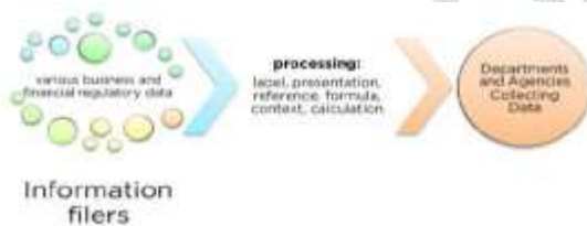
Fig. 1. SBR working Process

In Dutch, a Business organization uses Digipoort, which includes administrative communications between stakeholders and a specific public in electronic mode i.e. the "electronic post office", to report to the government parties. Digipoort is a secured digital line from the government and the link of the same is facilitated directly from the software so that the businesses can easily deliver the compliance information to the regulatory agencies. Within Digipoort, the information is processed and validated with the feedback signals transmitted to sender. The traditional method uses manual reporting process which is time consuming and includes duplicity and hence is not an ideal option for businesses. SBR on the other hand ensures the recording, compilation, tagging and submission of reports to the regulatory agencies by capturing time and supplying the same information several times to the concerned individuals as per the need. The delivery of information to the public is done via Digipoort only and banks/financial institutions use IPI etc.