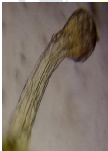
Fig.4. Trichome s