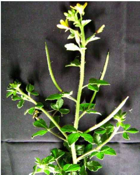
Fig. 1. Cleome viscosa Linn