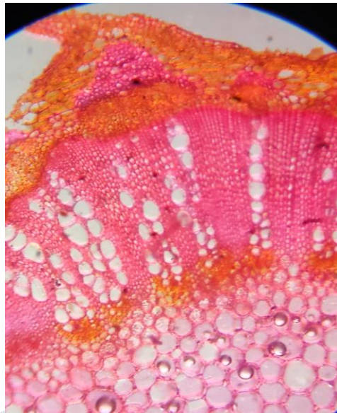
Fig. 2. T.S. of Stem