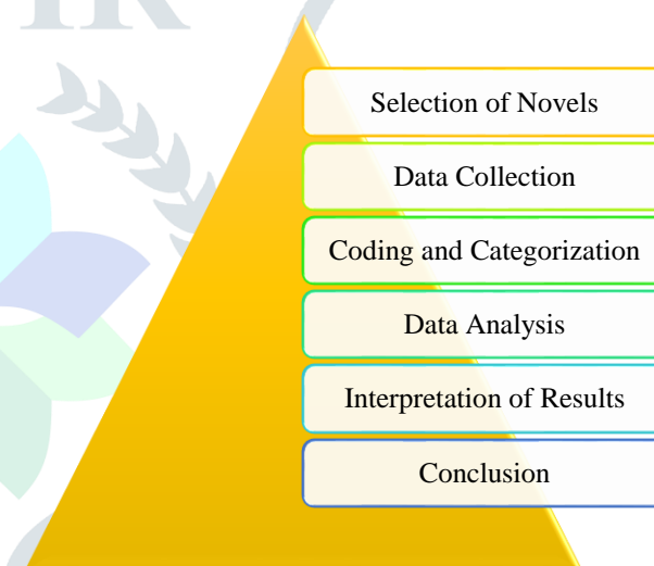
Fig 1: Flowchart of methodology

Chetan Bhagat is one of the most popular contemporary Indian authors, known for his novels that portray the lives of young Indians. This study aims to explore the different aspects of life depicted in the selected novels of Chetan Bhagat. The study will use a qualitative research methodology that involves a systematic analysis of the selected novels using content analysis.