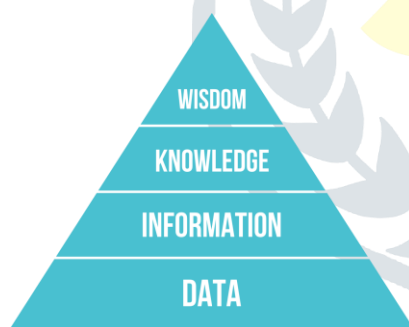
Fig: 1 Data Pyramid

The pyramid delineates the engineering and clarifies about the Data Management. It obviously gives the image of the information stream beginning from the crude information alongside its sorts through the Hadoop eco-framework and the expository motors to accomplish the last objective of the framework.