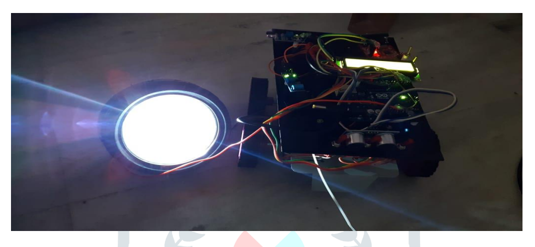
Fig.2 : Transmitter