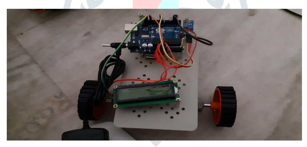
Fig.3 : Receiver