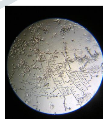
Figure: One of the samples collected during the experiment to check for fern patterns. The stage here is a fertile stage.

Below is a sample of fern pattern observed in the saliva sample: