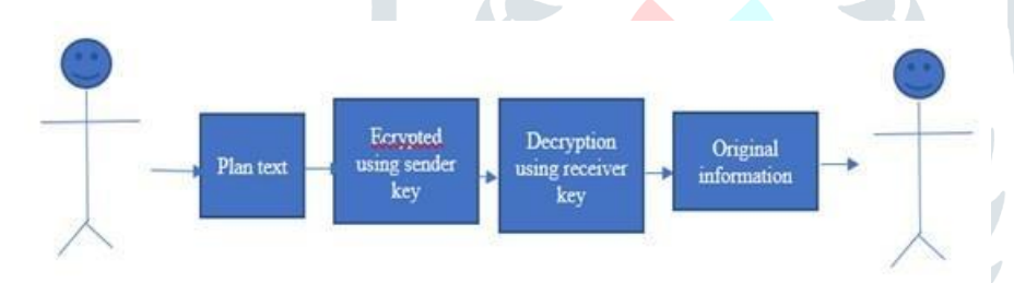
Fig 2.1. Encryption and Decryption

Cryptography is nothing but the method of hiding the information. Encryption and decryption of the information is been done. Cryptography is effective method to transmit the information for one person to another authorized person who can access the information. It can protect the sensitive information about particular thing which is stored and in transmitted with network protocol. Now a days the communication takes place through social media and the information are been passed through email and different sites so the information can be hacked by third person which does not have the authority of that particular information. So the encryption of that information is must needed. Encryption of that information will help the sender and receiver to keep the information in the secret, even the hackers can hack the information. [2][4]