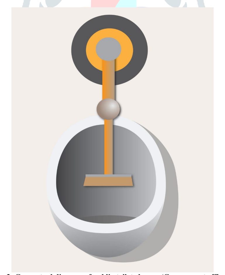
Fig 3: Conceptual diagram of public toilet cleaner (Government offices)