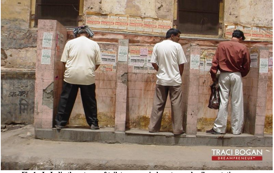
Fig 1: In India these types of toilets are use in bus stop and railway station.

The advantages of the system are that it reduces the labour work and its working is flexible. In India this type of project is not implemented. It is affordable for Indian <mark>Railwa</mark>y department for its implementation. This system is robust and it has long life.