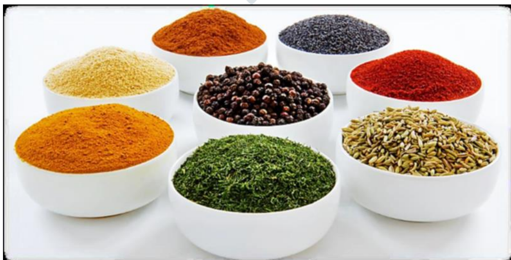
Some spices are in powder form