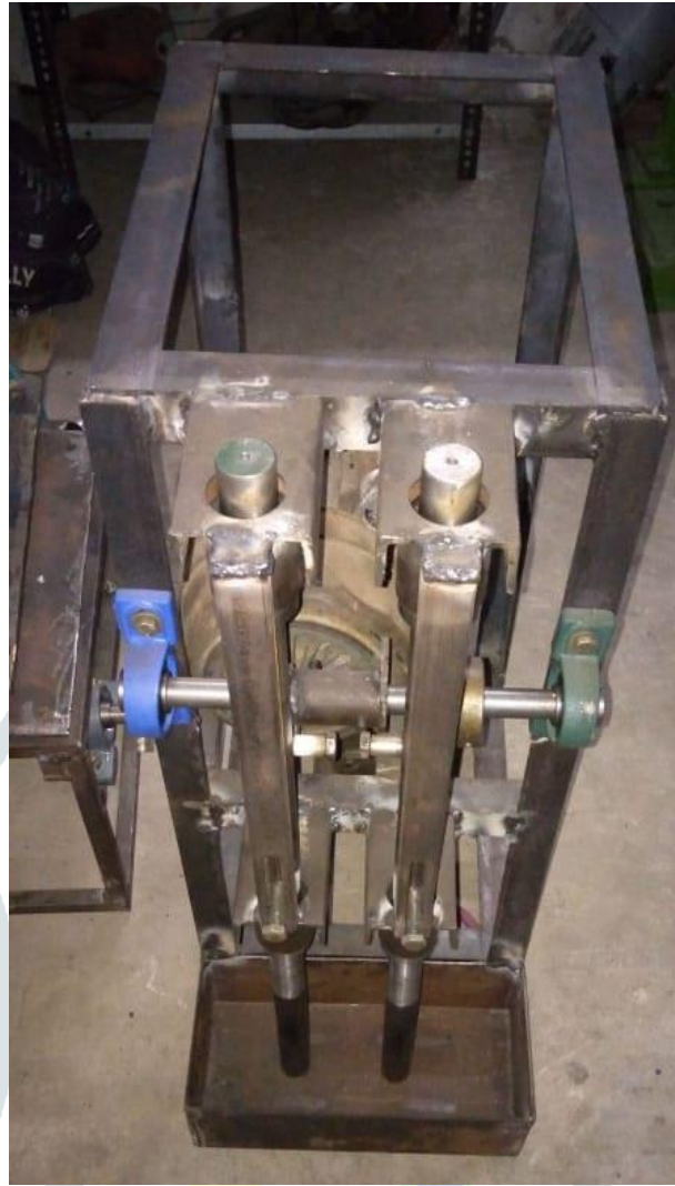
Front view of spices processing machine