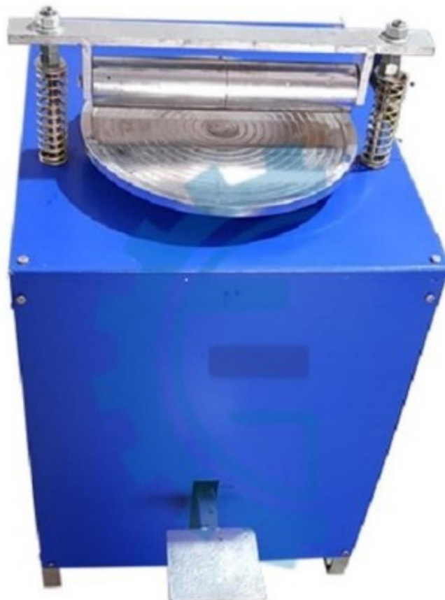
Front View of Papad making machine

In this project we have concluded that as day by day there is more requirement of skilled labor because of faster rate of development in food processing area. Hence to reduce human effort and to reduce working time for Papad flattening operation we have developed simple Papad making machine for production of Papad which plays an important role in middle class people's business. Our machine makes Papad with the help of rolling & pressing mechanism and v-belt drive with pulley arrangement is used to transmit power.