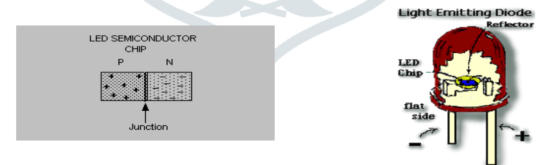
Fig 3.4.1 Led