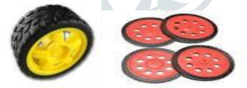
Fig 2. BO Wheels

Dragging a load using a wheeled cart is far easier than dragging it on the ground—for two reasons: Wheels reduce friction. Instead of simply sliding over the ground, the wheels dig in and rotate, turning around sturdy rods called axles.