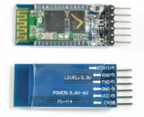
Fig 5. Bluetooth Module

The HC-06 is a class 2 slave Bluetooth module designed for transparent wireless serial communication. Once it is paired to a master Bluetooth device such as PC, smart phones and tablet, its operation becomes transparent to the user. All data received through the serial input is immediately transmitted over the air.