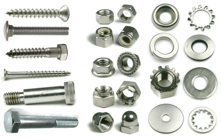
Fig 3. Various Fasteners