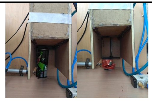
Fig 6 Mechanism of the machine