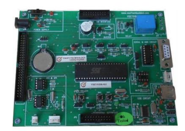
Fig 4 Micro Controller

A micro controller is an electronic circuit controller system which can be programmed to synchronies the movements of the pneumatic cylinder