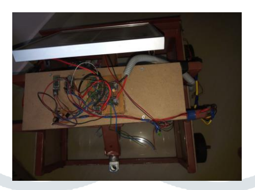
Fig.4: Actual model

Electrical energy of the battery is converted to mechanical energy through a set of blades designed to achieve cutting operation. The electric circuit ensures power transfer from the battery to run the D.C. motor, whilst the solar panel power to continuously recharge the battery while in operation. The cutting blades tap power from the D.C. motor. When the power switch is on, the electrical energy from the battery powers the motor which in turn actuates the blades. The solar panel generates current to recharge the battery, thereby compensating for the battery discharge. The rotating blades continuously cut the grass as the mower is propelled forward and the cut grass. Height of cut is adjusted by means of the link mechanism via the lift rod.