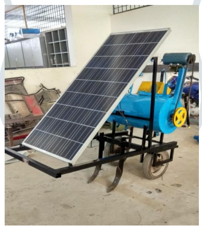
FIGURE 2: Final view of Machine