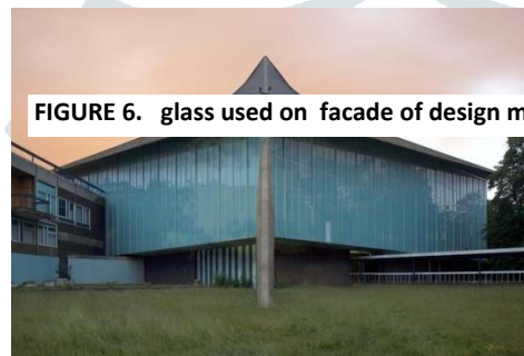
FIGURE 6. glass used on facade of design museum

It is a cricket pavilion in St. Edwards school, Oxford. The two most legible elements are there one is plinth and other is a roof. Its roof is cantilevered as it looks like a sandwich wall are appearing as a filling in between two slices of bread i.e. plinth and roof. Materials are used in a very proportionate way to give a rich appearance. Its design began with the idea of elevating walls which look like grown from the mound on the ground as shown in fig 5.