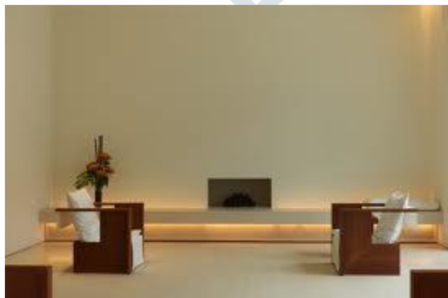
FIGURE 1. Interior of De Camaret house

In interior he has not been provided any unnecessary furniture or other items and create a more spacious room with clean, simple walls painted in white color. Interior lighting is provided in a very good way he is making the walls of clutter free and providing just a simple lighting where he provides a concealed lighting fixture. He also hangs a few framed pictures with a simple frame and try to avoid bright colors and patterns on walls and maintained an organized look. He provides simplicity in furniture style also. Organized look of the room provides a pleasing appearance as shown in figure 1.